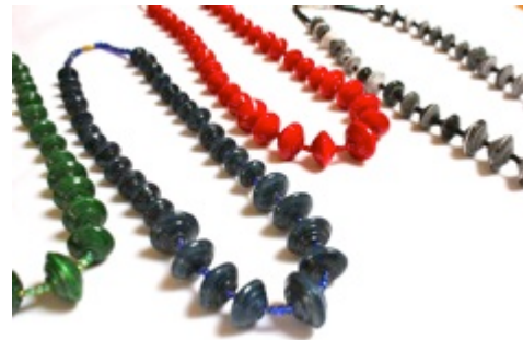
Item #51 Paper-Bead Necklace Made from rolled pieces of paper (Short) $6/ 4,000 RWF