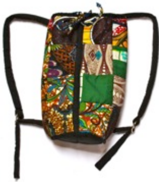
Item #33 Back Pack Large, cylindrical backpack with two adjustable straps. (28x40x16 cm) $14/9,500 RWF