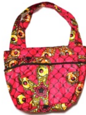
Item #16 Julia Bag – Two straps. Two outer pockets. Perfect for day purse. S – (30x24 cm) $14/ 9500 L – $15/ 10,000