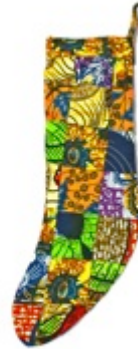
Item #63 Christmas Stocking – kitenge Patchwork Christmas Stocking. (16 x 55 cm) $4/ 3,000 RWF