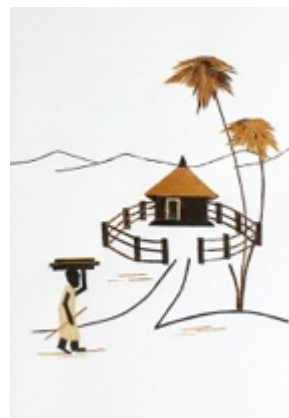
Item #59 Banana Leaf Cards Banana leaf design on cardstock. Included envelope $1.50/ 1000 RWF (per card)

Tubahumurize Association B.P. 687 Kigali Rwanda +250 788 4285 80