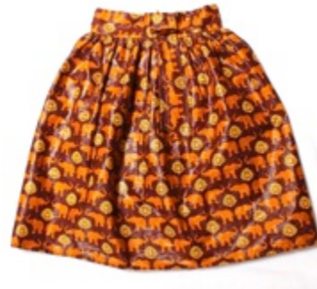
Item #36 Ladies Skirt Available in long and short. Made from fabric of your choice. Custom sizing available. $12/ 8,000 RWF

Tubahumurize Association B.P. 687 Kigali Rwanda +250 788 4285 80