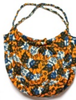
Item #18 Bag with braided straps – another useful day purse. Two braided straps. No zipper. $13/ 8,800 RWF

Tubahumurize Association B.P. 687 Kigali Rwanda +250 788 4285 80 www.rwandanwomencan.org