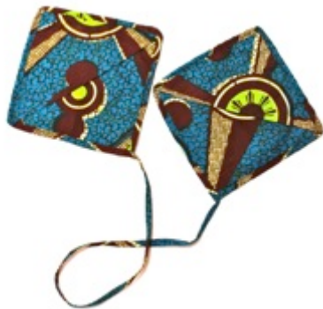
Item #39 Hot Pads Padded for insulation. Includes pockets for holding pots (23x23 cm) $6/ 4,000 RWF