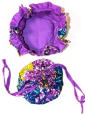
Item #56 Jewelry Case – Padded, round bottom. Drawstring. Perfect for earrings, necklaces, etc. (10 x 8 cm) $3/ 2,000 RWF