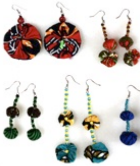
Item #48 Fabric Earrings - Made from kitenge fabric pieces. Variety of styles available. $4/ 3,000 RWF