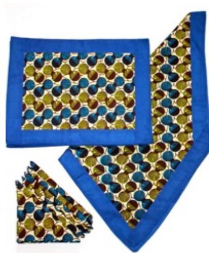
Item #42 Table Runner Set Includes 1 table runner, 6 place mats, and 6 napkins (45 x 145 cm) $35/ 24,000 RWF