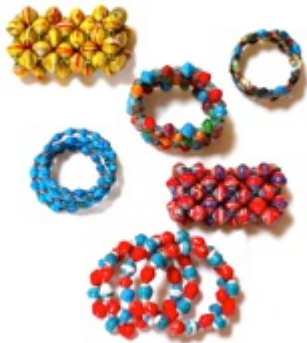
Item #54 Paper-Bead Bracelet Beads made from rolled pieces of paper. $3/ 2,000 RWF