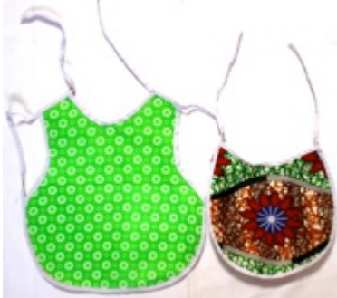
Item #62 Baby Bibs – Two sizes available. Machir washable. S – (22 x 20 cm) L – (32 x 29 cm) $4/ 3,000 RWF