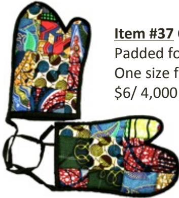
Item #37 Oven Mitts Padded for insulation. One size fits all. $6/ 4,000 RWF