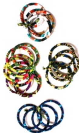
Item #53 Fabric Bracelets - made from pieces of kitenge fabric. Includes 4 bangles. $2/ 1,500 RWF

Tubahumurize Association B.P. 687 Kigali Rwanda +250 788 4285 80