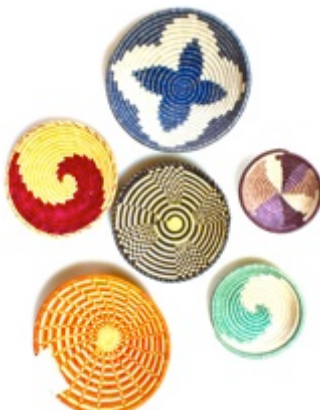
Item #58 Woven Baskets Variety of sizes, colours, and designs available. S - $6/ 4,000 RWF L - $7/ 5,000 RWF