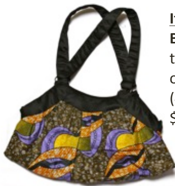
Item #15 Party Bag - Finishing touch for any outfit. (40x15 cm) $10/ 6,800 RWF