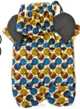
Item #61 Children's Backpack Shaped like an elephant. Two adjustable straps. Zipper in the back. (28 x 50 cm) $14/ 9,500 RWF