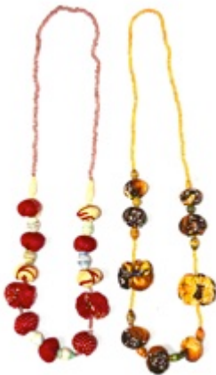
Item #50 Fabric Necklaces – Made from beads and kitenge fabric beads. ($6/ 4,000 RWF)