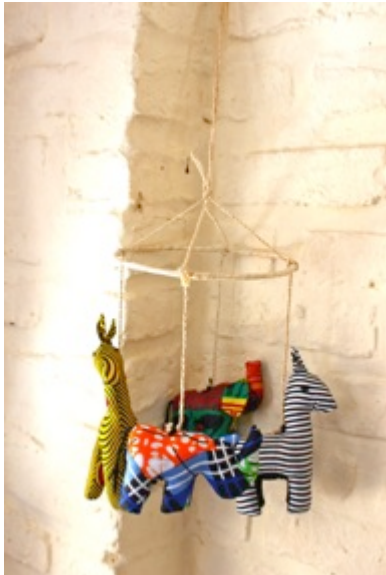
Item #64 Animal Mobiles African animals made from kitenge fabric. Circular and string mobiles available. Circular: 50 cm long String: 85 cm long $12/ 8,200 RWF