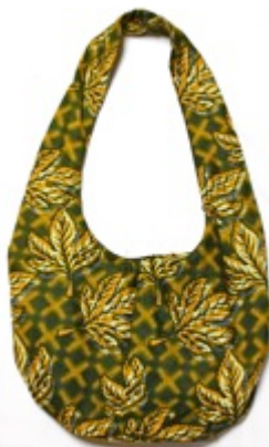
Item #17 Clementine Bag – Sling bag with rounded bottom. One strap. Zipper for security. (42x32 cm) $10/ 6,800 RWF