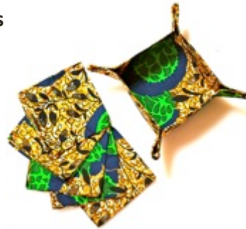
Item #40 Star Napkin Holder Includes 6 35 x 35 cm napkins. ($12/ 8,200 RWF)