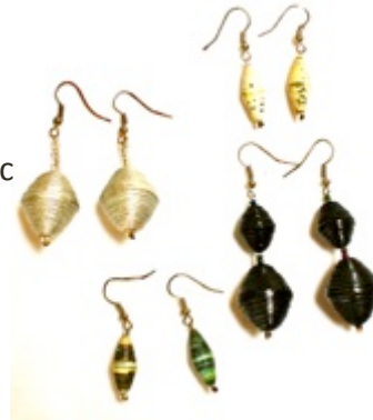
Item #49 Paper Earrings – Made from rolled pieces of paper. Variety of styles available. $4/ 3,000 RWF