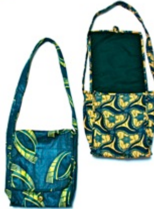
Item #14 Book/ Computer Bag – Designed to carry schoolbooks, notebooks, etc. Zipper and flap for protection (38x26 cm) $12/ 8,200 RWF