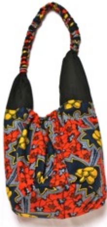
Item #31 John Bag Sling bag. One thick, twisted strap. Zipper for security. (40x33 cm) $14/ 9,500 RWF