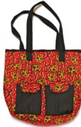
Item #32 Diaper Bag Large bag perfect for use as a diaper bag. Two straps. Inside pockets and two outer pockets. (43x40 cm) $14/ 9,500 RWF