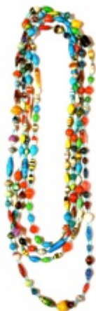
Item #52 Paper-Bead Necklace Beads made from rolled pieces of paper. Long (can double or triple the string) $7/ 5,000 RWF