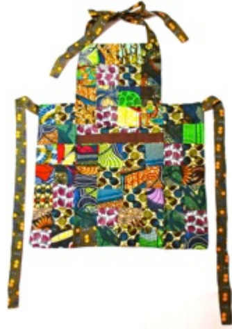
Item #38 Apron Beautiful kitenge patchwork apron. One size fits all. ($12/ 8,200 RWF)