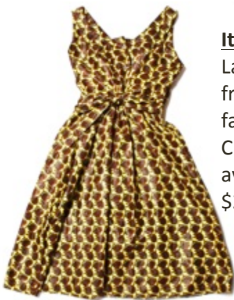
Item #35 Ladies Dress Ladies dress made from kitenge fabric or fabric of your choice. Custom sizing available $22/ 15,000 RWF