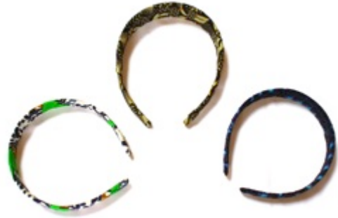
Item #55 Fabric Headband - headband wrapped in kitenge fabric $3/ 2,000 RWF