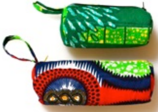
Item #60 Pencil/ Glasses Case S – (16 x 5 x 5 cm) L – (20 x 7 x 7 cm) $3/ 2,000 RWF