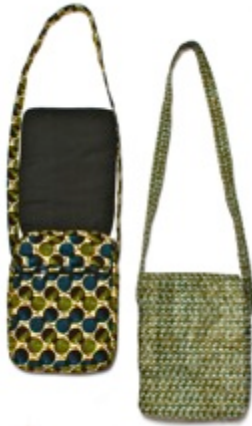
Item #13 iPad bags - One strap. Padded. Flap and zipper for protection. Outer pocket for charger. (25x30 cm) $12/ 8,200 RWF