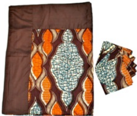
Item #41 Tablecloth/ Napkins Kitenge table cloth. Includes 6 napkins. (2.5 m x 1.5 m) $26/18,000 RWF