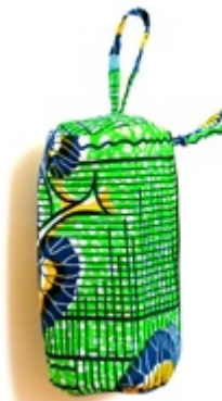
Item #57 Cosmetic Bag – with many pockets and a divider. Padded for protection. (27x13x13 cm) $8/ 5,500 RWF